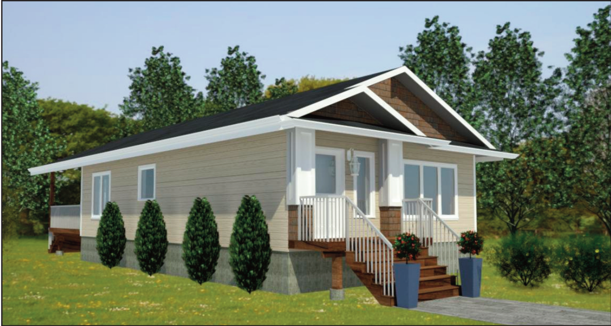
Some features shown may be optional